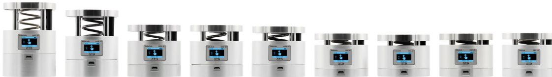
10 N/mm 25 N/mm 30 N/mm 35 N/mm 40 N/mm 50 N/mm 60 N/mm 75 N/mm 150 N/mm

A calibrated CBSF force gauge is available for each of the spring constants specified in applicable standards for checking biomechanical thresholds and is ready for immediate measurement without further preparation. The heart of the aluminum-made force measurement device is the force sensor with linear-guided measuring mechanism. The mechanics guarantee optimum measuring accuracy and reproducibility, while the integrated electronics analyze and save the measured values. The transient and quasi-static measured values are shown on the display. Data transmission to the CoboSafe-Vision evaluation software is wireless or alternatively via USB interface. The small dimensions allow easy positioning of the device.