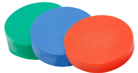
Damping elements K1