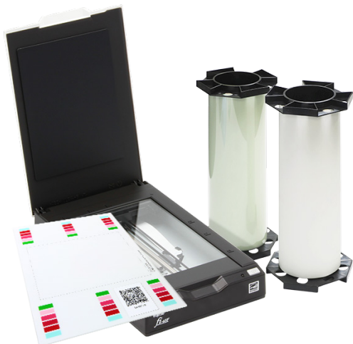
Scanner, calibration sheet and films

The system is particularly suitable for applications that require very detailed results. The collision pressure is recorded as a 'film'. By synchronizing with the force curve, the pressure values and the pressure distribution can be determined and visualized for the required transient and static pressure. With this system, all requirements can be fully represented. It consists of various film sensors, a handle for picking up the foils and a hub (interface). The film sensors are ultra-thin, flexible PCBs with circuits and pressure-sensitive cells that can be used multiple times.